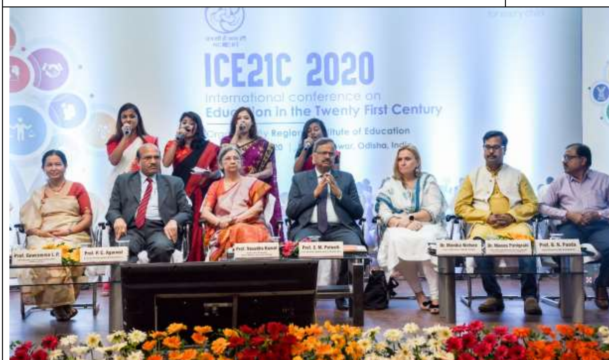
The Inauguration of International Conference on Education in Twenty First Century held on 21-23, February 2020