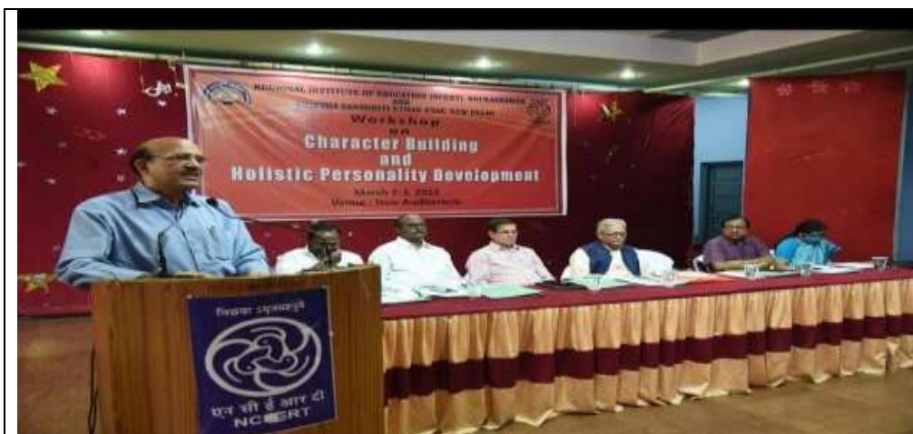
Workshop on Character building & Holistic Development held on 2-3. March 2022