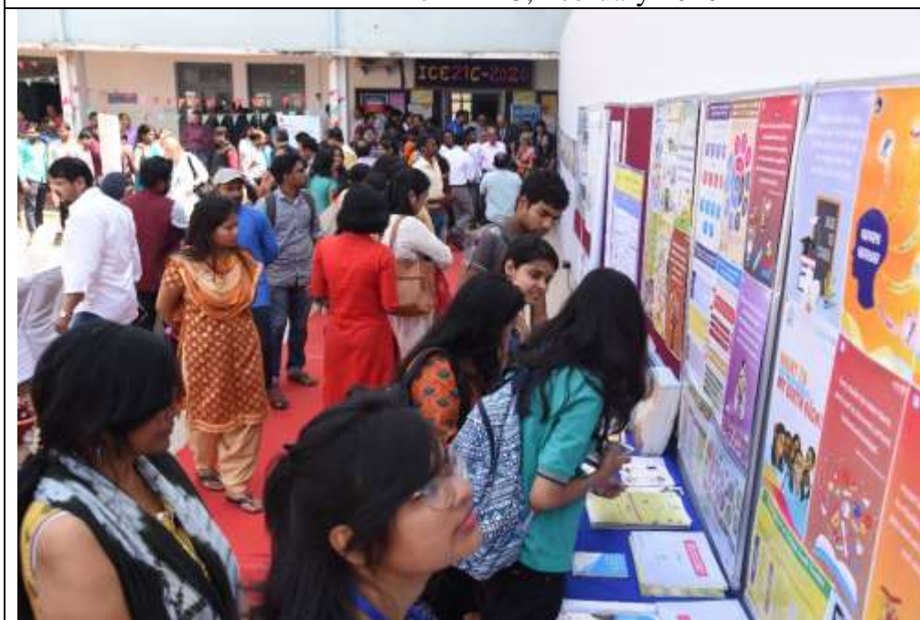
Students participated in poster presentation and interacted with foreign delegates to have international perspectives in education system